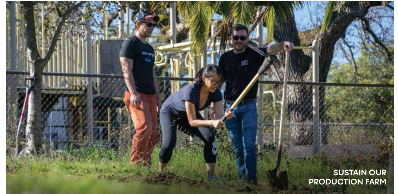
SUSTAIN OUR PRODUCTION FARM

BE PART OF A BETTER FUTURE FOR ALL OF US IN MARIN.