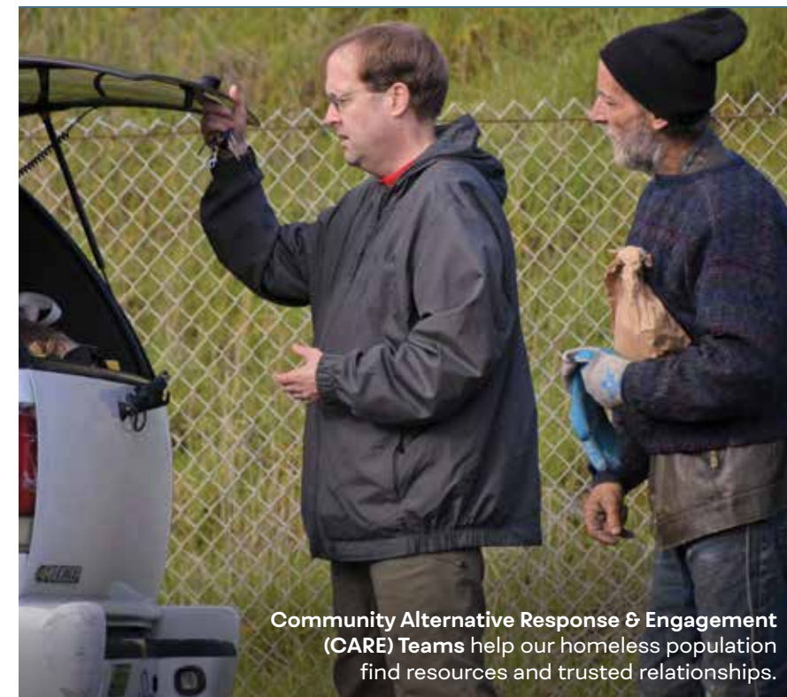
Community Alternative Response & Engagement (CARE) Teams help our homeless population find resources and trusted relationships.