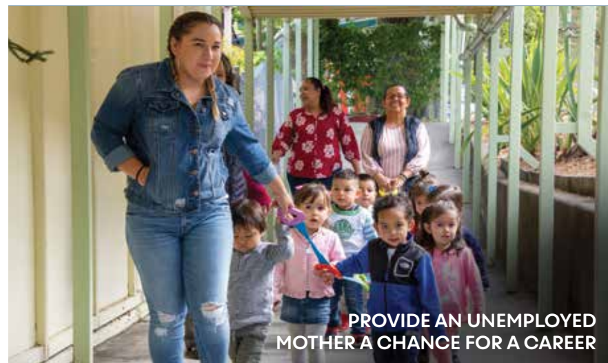
PROVIDE AN UNEMPLOYED MOTHER A CHANCE FOR A CAREER

= ALLEVIATE AN URGENT SHORT-TERM CRISIS for a family through safety net services including emergency financial support for food, rent, and necessities